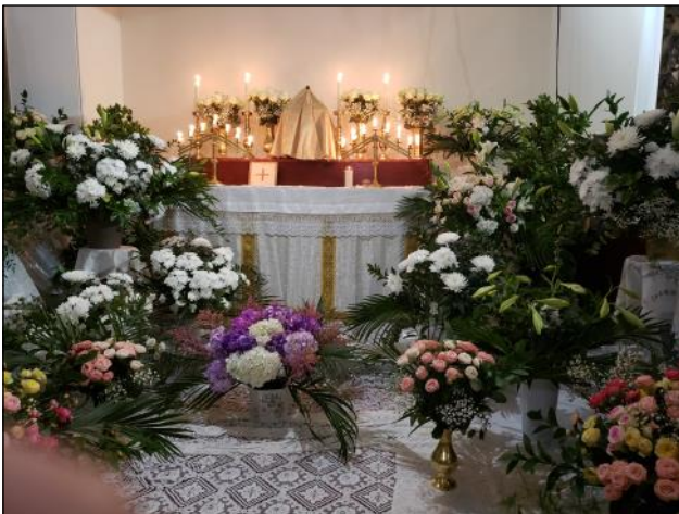
The altar of repose, (the Garden) on the evening of Maundy Thursday

A slightly different format for our June edition. Normally, this page is devoted to news from our Apostolate here in Scotland but so much has happened over the last month that I couldn't do it justice on one page so I shall 'spill over' onto the inside pages to give you an idea of the fecund state of our two churches. Similarly, publication is somewhat late so that we can put in pictures of the Confirmations in Edinburgh.