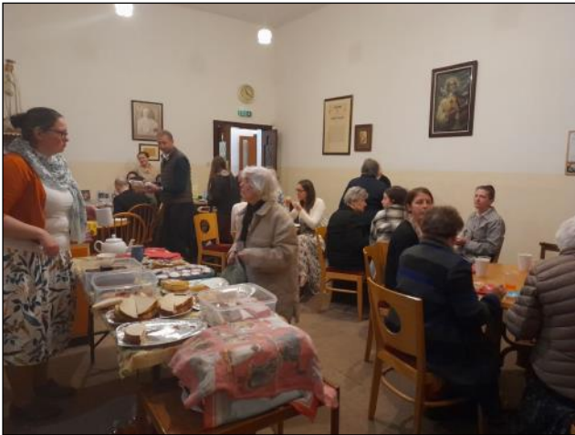
The parish celebration in Glasgow was a great success, spilling over into the garden in front of the church