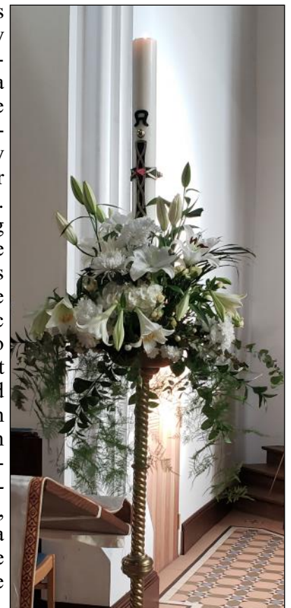
The exuberant Paschal Candle in Edinburgh

Many thanks to our choirs and the 'flower ladies' who beautified our churches with their artistic talents over the fifty days of the Easter season. Extra Masses and the requisite solemnity were amply provided by their generous efforts. An interesting note about these fifty days was provided by one of our Gaelic speakers, who told me that Whitsun is called a Chaingis in Gaelic, taken from an adaptation of Quinquagesima in Latin, thus providing a parallel with the fifty days before Easter.