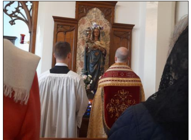
Our Lady of Aberdeen crowned with flowers for the month of May

garden where some cover had been provided along with the cooking equipment. The Edinburgh celebrations take place on the 10 th of this month.