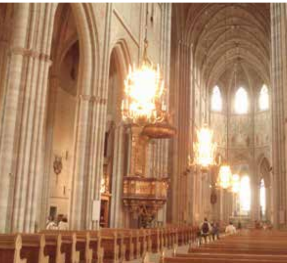
The formerly Catholic Cathedral of Uppsala.