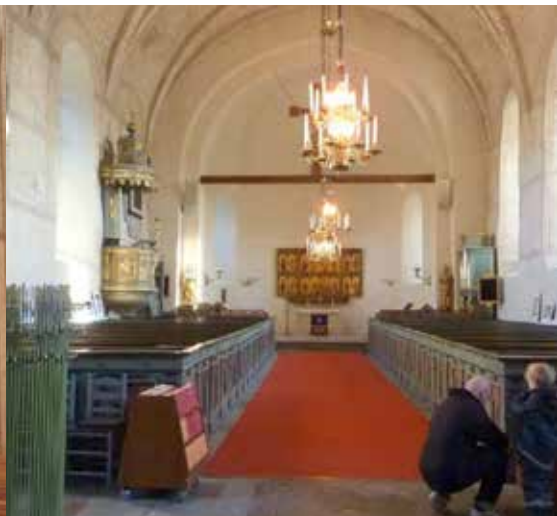
The Old Church, Old Uppsala, Sweden.