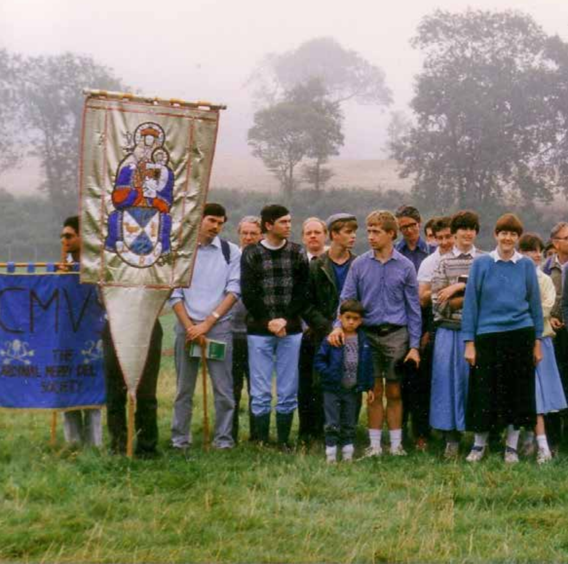
These are the pioneer pilgrims on the first Canterbury Pilgrimage.

On This Day - 1987 Canterbury Pilgrimage