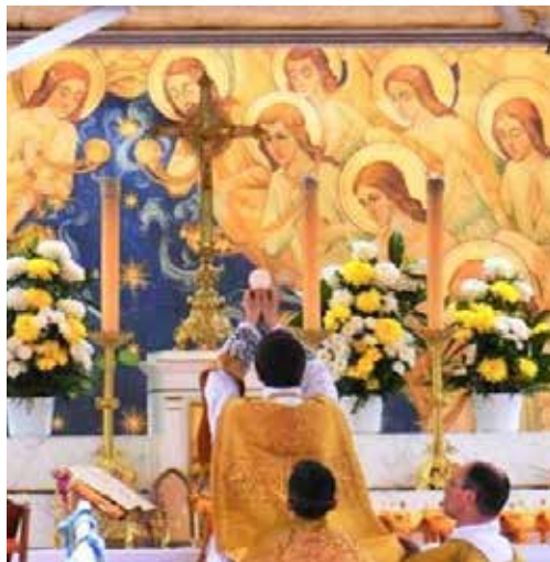
Chartres Pilgrimage 14th-16th May 2016