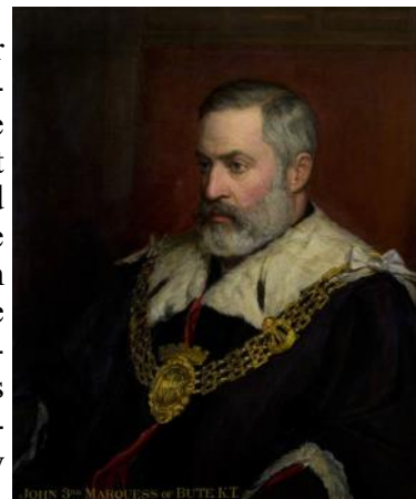
The 3 rd Marquis of Bute

The matter was further complicated by the fanciful notion that St. Andrews could once again become the Metropolitan See. Since the number of Catholics in St. Andrews didn't top two dozen, the idea may seem, at first sight,