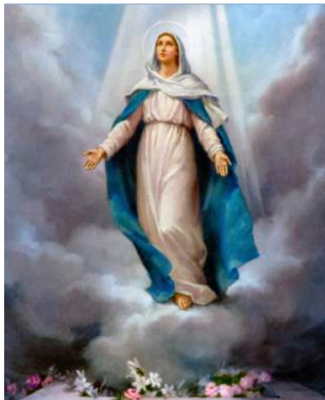
The Assumption of the Blessed Virgin Mary