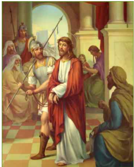
Jesus is condemned to death.