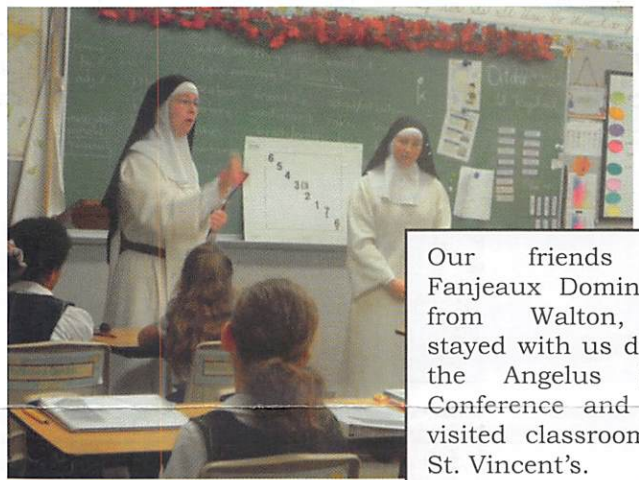
Our friends the Fanjeaux Dominicans from Walton, KY stayed with us during the Angelus Press Conference and then visited classrooms at St. Vincent's.