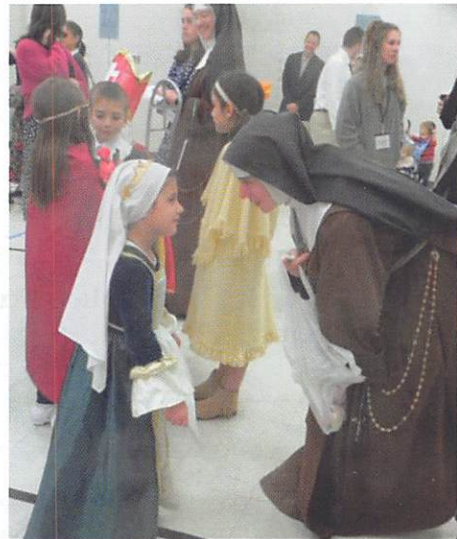
All Saints Day Party! The High School girls did an excellent job organizing the event.