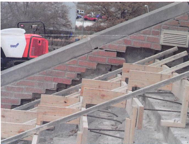
The next stage for the front steps will be the repair of the bricks on either side. In addition to the unavoidable damage from the demolition, the bricks have shifted with the ground over time. We hope to include the tuck-pointing of the mortar on the chapel wall above the steps in this project. In the meantime, our vexatious boiler system has acted up again, and continues to provide us with opportunities to practice patience and humility. It needs more work.

In addition to trying to develop a new website, we are looking into ways to provide more options than Paypal for those who prefer to make electronic donations. Thank you for your patience as we drag ourselves kicking and screaming into the 21 st century.