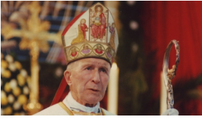
Archbishop Lefebvre on the first interreligious gathering at Assisi in 1986.

Answering questions from the periodical Pacte in 1987, Archbishop Marcel Lefebvre stated his views about the interreligious meeting called for by John Paul II in Assisi on 27th October 1986.