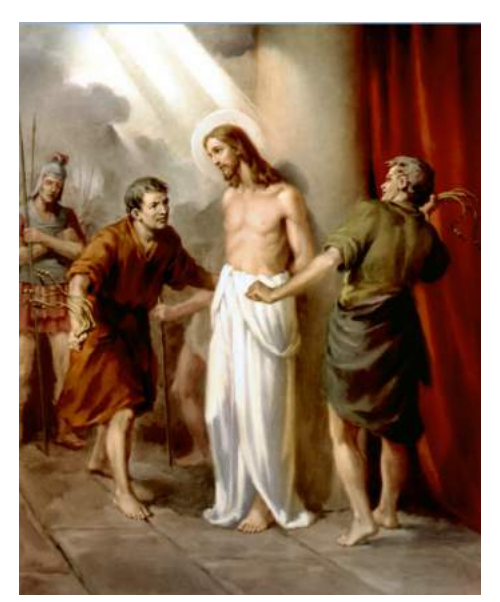
The Scourging at the Pillar